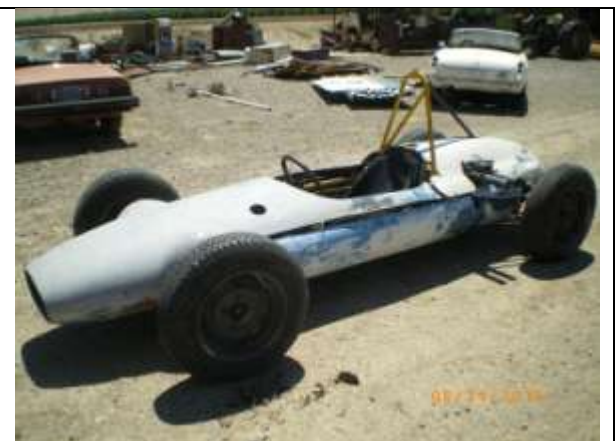
BMC Huffaker MkII BMC Huffaker MkII