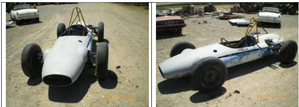
BMC Huffaker MkII BMC Huffaker MkII